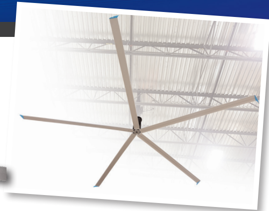
MODEL 26' (8.0 m)