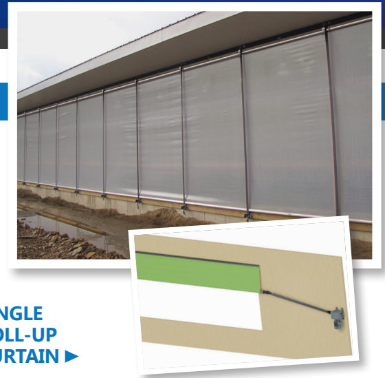
SINGLE ROLL-UP CURTAIN ▶